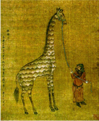
Painting by Shen Du (1357-1434)

Zheng He was born in China 1371. He was a Chinese Muslim from the Hui ethnic group , or group of people with a shared background. His original name was