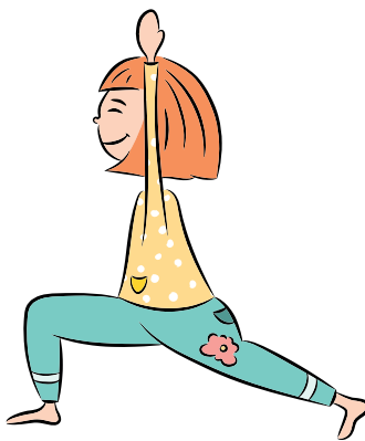
Warrior 1 Pose