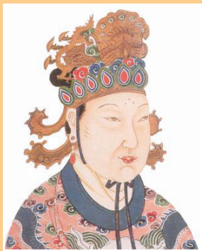
Official portrait of Wu Zetian