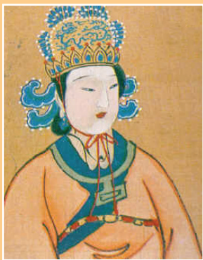
Drawing of Wu Zetian