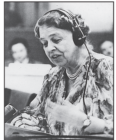
Eleanor Roosevelt in 1947 when she was a delegate to the United Nations.

Eleanor died in 1962. She was greatly loved for working to help people have freedom and opportunities.