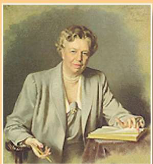
Eleanor Roosevelt as First Lady