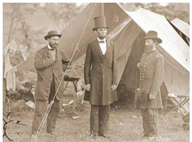
Lincoln visiting a Union camp