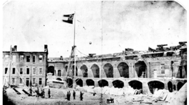
Fort Sumter, South Carolina, after taken by the Confederates

In 1865, the Confederate Army surrendered and the war ended. The South began the long and difficult process of Reconstruction, and the 13th Amendment abolished slavery in 1865.