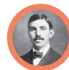
— Edward Kasner