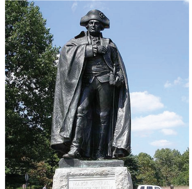
Statue of Von Steuben at Valley Forge

1. The soldiers at Valley Forge are often thought of as having endured harsh conditions during their time there. This is true, but it wasn't just at Valley Forge where they faced hardships – back then, soldiers had to make do with very little clothing, food, and supplies all throughout the war. Do you think you would have been a good soldier in the Continental Army? What would you have done to get by with so little?