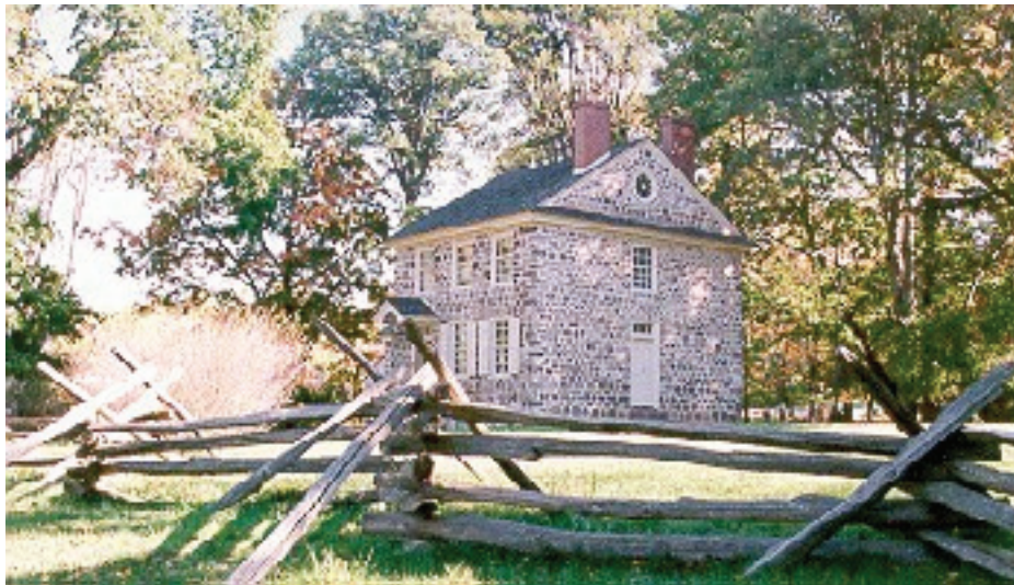
"Main Headquarters" at Valley Forge

Valley Forge is the site of the Continental Army's camp during the winter of 1777 during the American Revolution. Armies often sought out places to camp for winter since back then it was hard to fight under snowy conditions. General George Washington needed a secure location for his troops to stay that winter, and chose Valley Forge. His soldiers' time at Valley Forge is often considered the turning point of the Revolutionary War. While they stayed at the camp, they were trained by a former Prussian officer named Friedrich von Steuben, who helped them leave the camp in the summer with new fighting techniques that helped them win the war and American's independence.