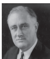
Franklin Delano Roosevelt

3. The 39th president graduated from the U.S. Naval Academy in 1846 and signed treaties stopping the U.S. operation of the Panama Canal. In 1879 he signed a bill creating the Department of Education. He was the first president born in a hospital.