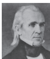
James Knox Polk

1. He graduated from Harvard Law School in 1845. In 1880 he visited San Francisco, becoming the first president to visit the West Coast. His wife, known as “Lemonade Lucy,” refused to serve alcohol in the White House. He had the first telephone installed in the White House by Alexander Graham Bell.