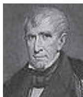
William Henry Harrison

Test your knowledge about the United States Presidents. Draw a line from the photo to the facts.