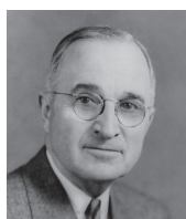
Harry S. Truman

3. Our 33rd president first served as vice president under Roosevelt. His Fair Deal program extended Social Security to 10 million people, and raised minimum wage to 75¢ an hour. He dropped the first atomic bombs, killing more than 200,000 people and ending World War II.