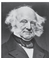
Martin Van Buren

3. Our eighth president was the first to be born in the United States of America. He took his four years salary, $100,000, in one lump sum at the end of his term. He and his wife spoke Dutch at home. After one term as president, he tried three times, unsuccessfully, to be reelected.