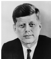
John F. Kennedy

2. As a war hero, and the first president, he is the most famous of all the founding fathers. He valued all human life and freed his slaves. Surprisingly, he didn't go to school past the age of 15.