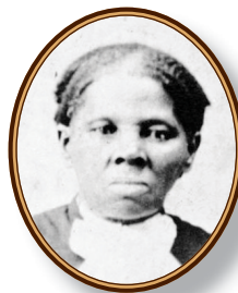
Rev. Jermain Wesley Loguen 1813-1872

The most famous conductor on the Underground Railroad, Harriet Tubman was called the “Moses” of the movement. A former slave, she made 13 trips South to help others to freedom.