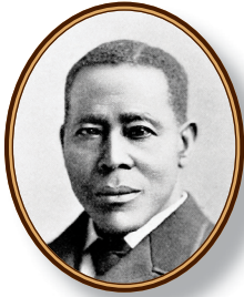
William Still 1821-1902

The Underground Railroad used codes to keep the activities secret. A conductor was a person who helped guide those escaping. A station master hid escaping slaves in a “depot,” or safe house.