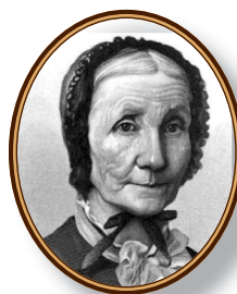
Laura Smith Haviland 1808-1898

A conductor in the Underground Railroad, Rev. Rankin hid over 2,000 escaping slaves in his Ohio home.