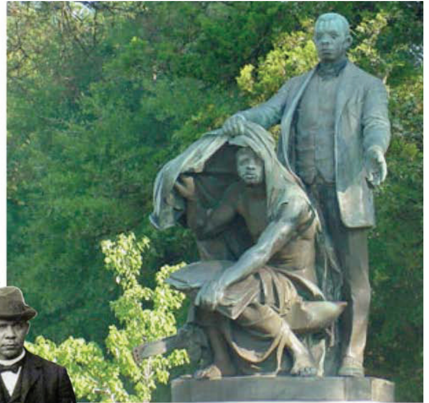
This monument called "Lifting the Veil" stands in the center of campus. The quote at its base reads: "He lifted the veil of ignorance from his people and pointed the way to progress through education and industry." ('he' meaning Booker T. Washington.)

Answer the question below on a separate piece of paper.