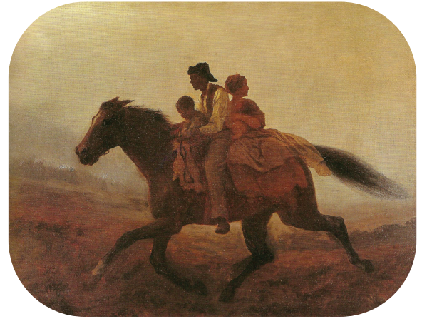
Ride for Liberty – The Fugitive Slaves, by Eastman Johnson

Started in the early 1800s, the Underground Railroad ended when slavery was abolished near the end of the Civil War. At least 30,000 people used the secret system to make their way to freedom.