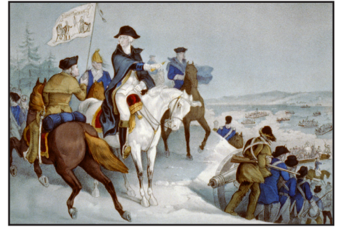
General Washington preparing to cross the Delaware River.

The American victory at the Battle of Trenton changed the course of the American Revolution. It raised the spirits of the American soldiers and more men volunteered for the army.