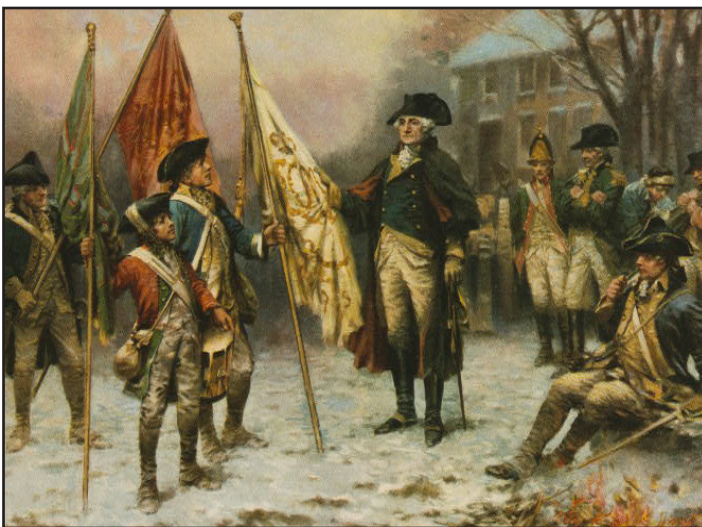
General Washington inspecting the captured flags after the Battle of Trenton