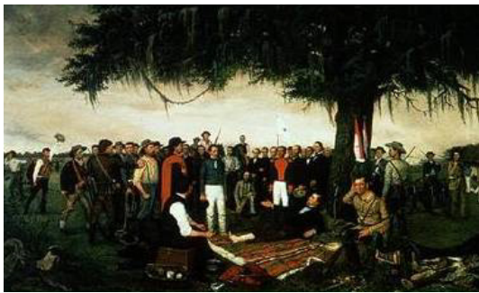
Painting of Santa Anna surrendering to Sam Houston after the Battle of San Jacinto. Houston was shot in the ankle during the battle. Here he lies under a tree with his ankle bandaged.

Alamo and Goliad, the Texas forces had retreated to the eastern part of the state. Santa Anna followed and believed he had the Texas forces cornered. He planned to attack the Texas forces on April 22. However, the Texas forces, led by General Sam Houston, made a surprise attack on April 21, 1836. Santa Anna had made a mistake and had not posted lookouts, so the Mexican soldiers were unprepared for battle. In 18 minutes, the battle was over, and the Texans had won their independence.