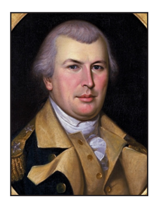
General Nathanael Greene, commander of the American forces at the Battle of Guilford Court House

The Battle of Guilford Court House was fought in Guilford County, North Carolina on March 15, 1781. Over 4,000 American troops under the command of General Nathanael Greene met about 1,900 British troops under Lord Charles Cornwallis. While the American forces