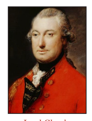
Lord Charles Cornwallis, commander of the British forces at the Battle of Guilford Court House

While the U.S. forces lost the battle, it was a costly victory for the British. The British lost almost a