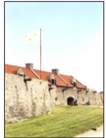
Fort Ticonderoga as it appears today.

Many of the guns and cannons from the fort were removed in the winter of 1775-1776 by the American forces. The fort was later taken by the British in July 1777, but was surrendered back to the Americans after the Battle of Saratoga in the autumn of 1777.