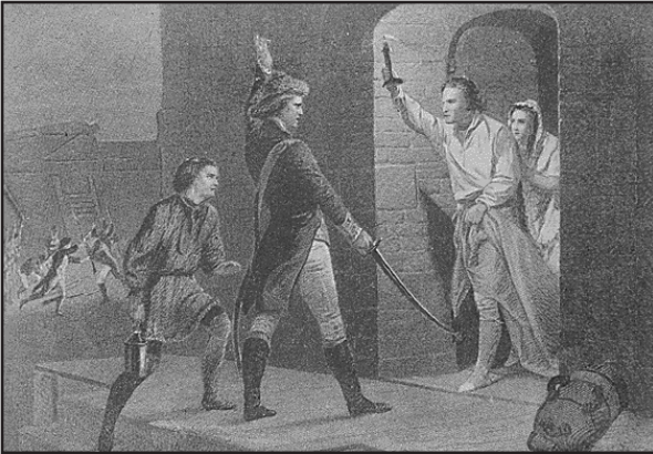
Drawing of Ethan Allen demanding the surrender of Fort Ticonderoga from Captain William Delaplace, commander of Fort Ticonderoga.

Fort Ticonderoga was a military fort on Lake Champlain in New York. Once known as Fort Carillon, Fort Ticonderoga was the location of several battles during the French and Indian War (1754-1763).