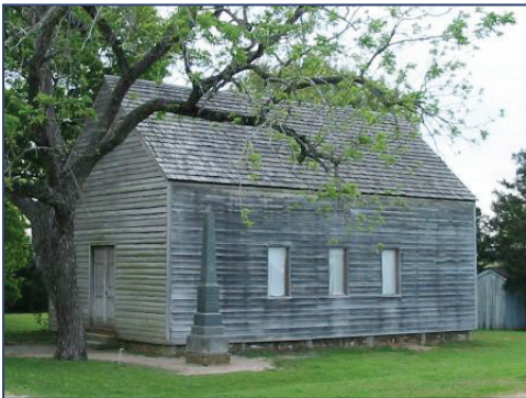
Reproduction of the cabin where the delegates met.

After the Mexican president, Antonio Lopez de Santa Anna, disbanded the state legislature and state militia, the conflict between the Texans and the Mexican government got worse. In 1835 Santa Anna sent troops into Texas. In October, the Texan army, made up of volunteers and the militia, met at the Battle of Gonzales. The Texans won the battle and the Mexican army retreated to San Antonio. The Texas Revolution had begun.