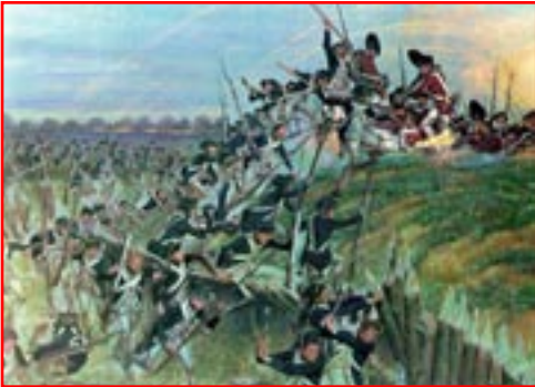
American troops, under Lt. Col. Alexander Hamilton, rushed the British fortification, called a redoubt, at Yorktown.