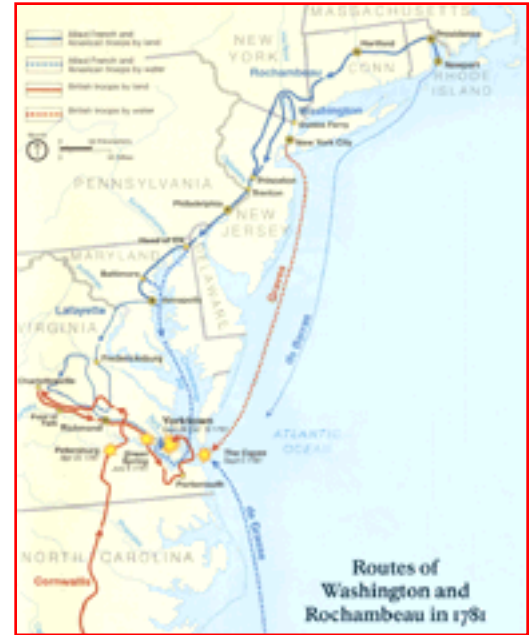
Washington marched to Virginia from New York to meet with the French navy, which sailed in from the West Indies.

The battle was fought in Yorktown, Virginia from September 28 to October 19, 1781. The battle was fought both on land and on the sea. The French army and navy joined the American army to fight against the British. The French army was lead by General Rochambeau and the French navy was headed by Admiral de Grasse.