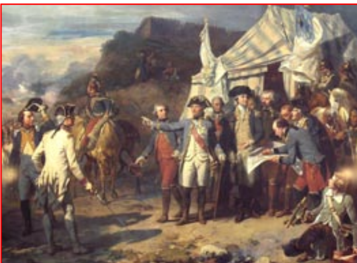
General Rochambeau (in light blue) and General Washington (in dark blue) at the end of the siege.