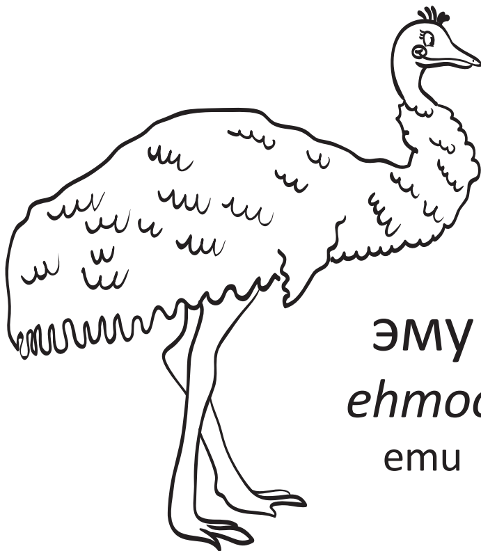
ЭМУ ehmoo emu