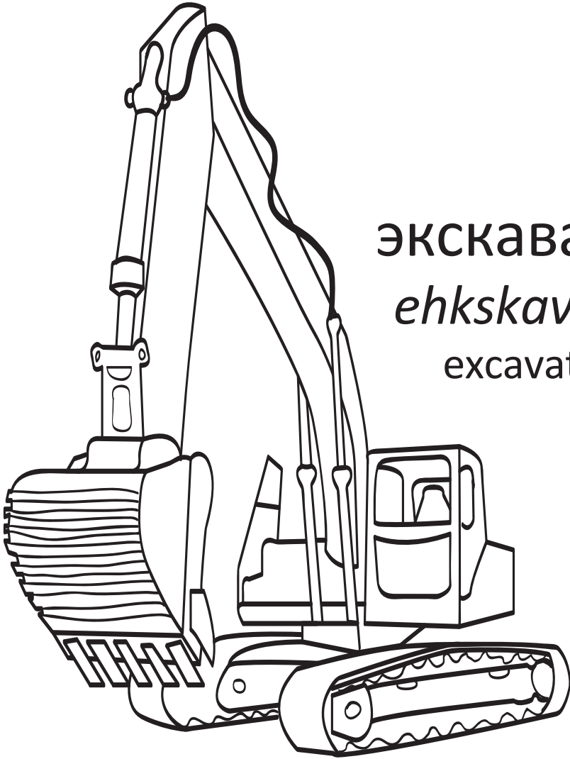
ЭКСКАВАТОР ehkskavator excavator