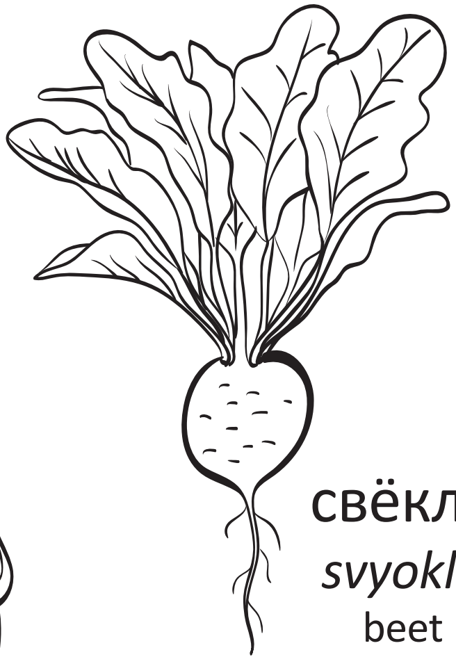
СВЁКЛА svyokla beet