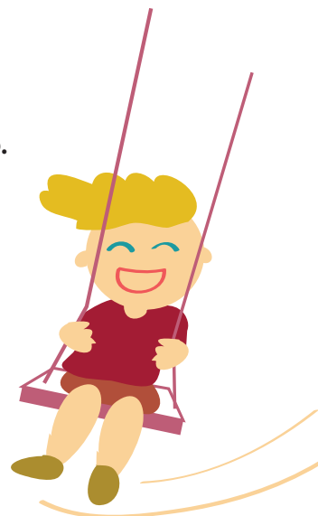
Playing on a swing