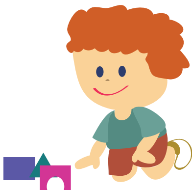
Playing with blocks