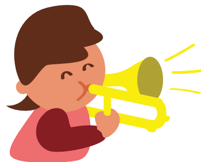
Blowing a trombone