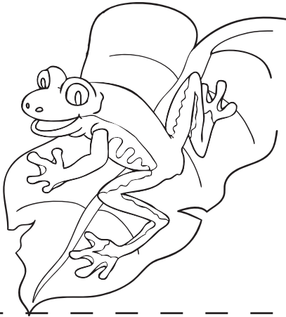
red-eyed tree frog