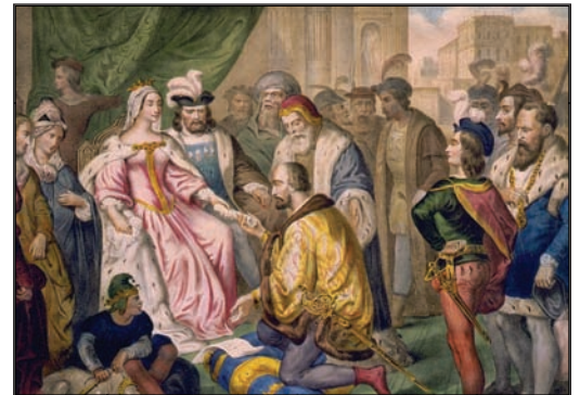
Painting of Isabella and Ferdinand meeting with Christopher Columbus.

Isabella died in 1504. Her children married into many of the royal families of Europe, including England and Portugal.