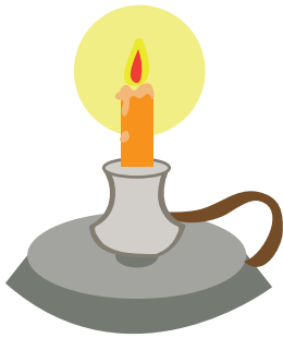
Lighting a room with candles