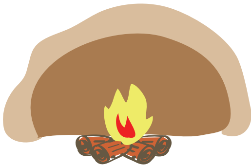
Living in a cave