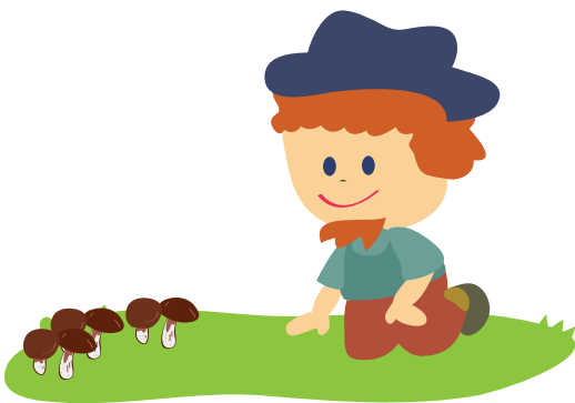
Foraging for food