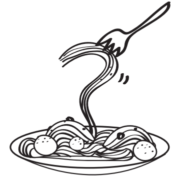
Popular Food: Pasta