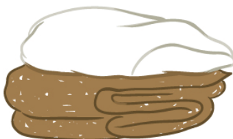
BLANKET and PILLOW