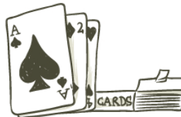
DECK OF CARDS