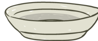
PAN FOR GOLD MINING