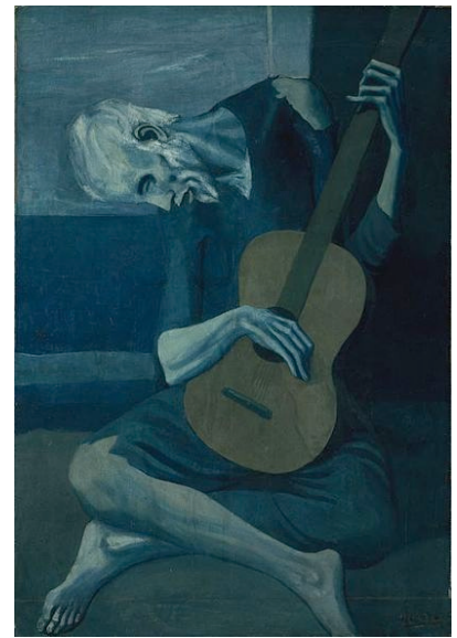
Picasso’s Blue Period

Throughout all of Picasso’s career, through all his different styles, he was also an illustrator. He would produce drawings, sometimes for books, that used fast-drawn lines that were then brushed with ink. These illustrations were very simple, and often only used very few lines, but a person could always tell just what Picasso wanted to show. In all of his many styles, he was always trying to find a way to show the world how he saw things in his imagination.