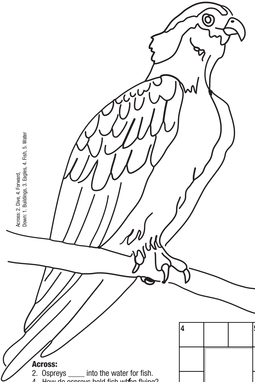
Across: 2. Dive, 4. Forward, Down: 1. Buildings, 3. Eagles, 4. Fish, 5. Water