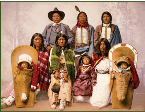
Ute chief and family, about 1899

The Ute is a tribe of Native Americans who lived in the western part of the U.S. They originally lived in Utah, Colorado and parts of New Mexico and Wyoming. In the tribal language, Ute means “people of the mountains.” The Utes were organized into several independent groups, called bands. There were at least 17 separate Ute bands.