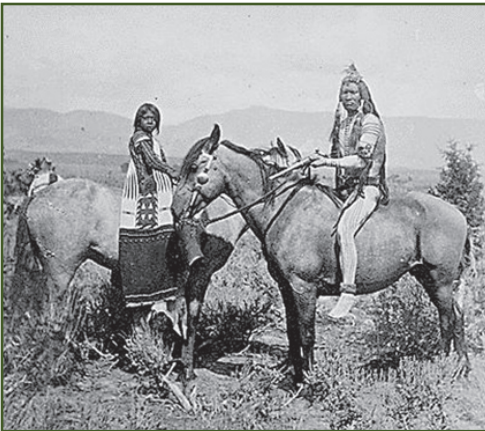
Ute bride and groom