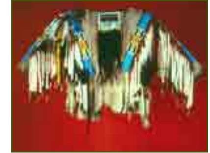
A Nez Perce beaded shirt