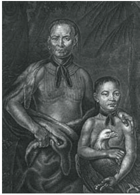
Chief Tomochichi and his nephew in 1733

After the American Revolution, President George Washington established a plan to encourage Native American tribes to adopt European culture and traditions. The Muscogee tribe were the first to follow this plan, followed by the Cherokee, Chickasaw, Choctaw and Seminole. The tribes that became part of the plan were called the “Five Civilized Tribes.”