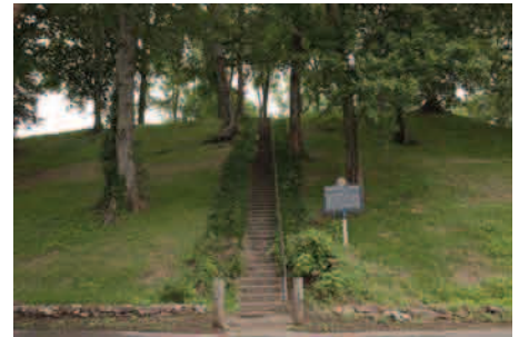
Earth mound in Florence, Alabama

The Muscogee, or Creek, Native Americans were originally part of the Mississippian culture in Tennessee. The Muscogee would later move south to Georgia and Alabama where they owned a large amount of land. The ancient Muscogee used earth mounds as platforms for buildings in their villages.