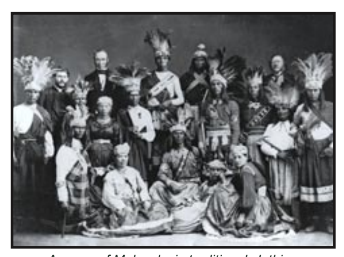
A group of Mohawks in traditional clothing meet with Montreal officials in 1869.