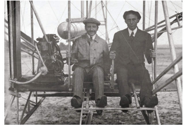
The Wright Brothers; Orville and Wilbur