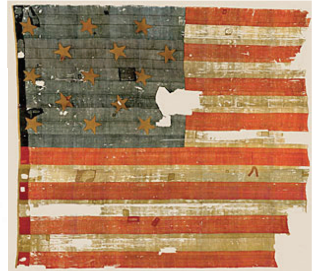
The Star-Spangled Banner at the Smithsonian Institution in Washington, D.C.