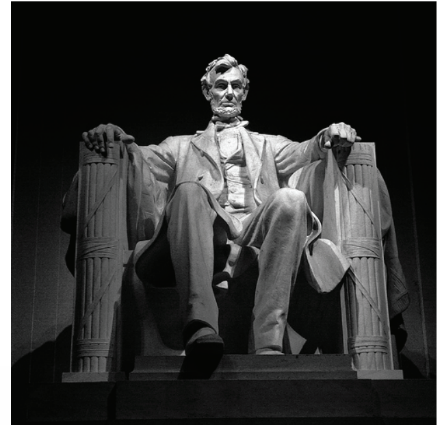
Lincoln Memorial in Washington, D.C.