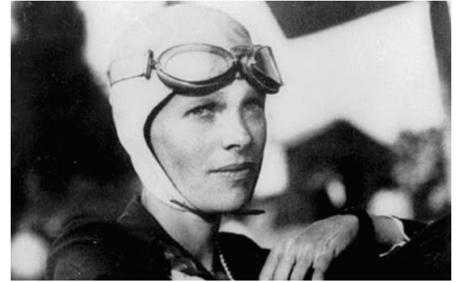
Amelia Earhart (1897-1937)

Amelia Earhart was a pioneer of flight and an important figure in women's equality. Aside from achieving many firsts in the aviation world, she was also the first woman to accomplish these feats and spent much of her career fighting for the acceptance of female pilots in aviation. Her plane, a Lockheed Vega 5B, is on display at the National Air and Space Museum. Earhart made two important flights in this plane: the first solo flight by a woman across the Atlantic in 1932, and later that year made the first solo nonstop flight by a woman across the U.S.