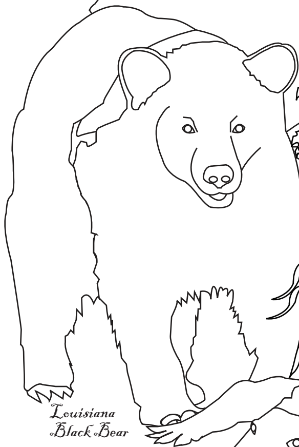
Louisiana Black Bear