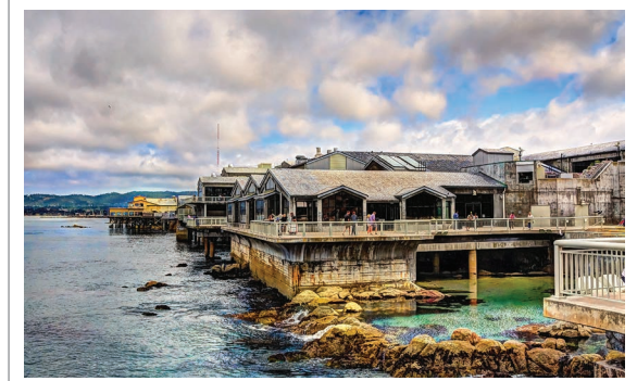
Monterey Bay Aquarium

Monterey is a city located on the Pacific coast of California. It lies at the southern edge of Monterey Bay. A bay is a large body of water where the land curves in from the ocean. Monterey Bay has an underwater canyon, or a valley with steep sides. This canyon is close to 300 miles long. It is 7.5 miles wide and more than 2 miles deep. It's the deepest ocean environment near a U.S. coast. Monterey's location near the canyon makes it a wonderful place to observe and learn about sea life.