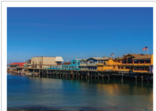
Monterey's Old Fisherman's Wharf

Monterey Bay Aquarium sits right on the rocky shore of Monterey. Many sea creatures—sometimes even whales—can be spotted from the aquarium's outdoor deck. This aquarium is one of the best in the world. It's a great place to observe and learn about all the sea life around Monterey. For an even closer look, whale-watching boats take people out into the bay. They leave from Monterey's Old Fisherman's Wharf. There, fishing boats also deliver their catch right to the restaurants along the wharf. People feast on fresh clam chowder and fish dinners. In Monterey, it's all about the sea.