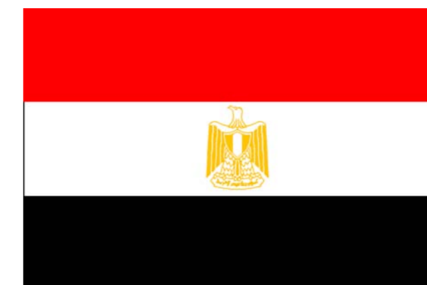
Modern Flag of Egypt

Did you know: the Nile river flows from the southern region of the country to the north and eventually the Mediterranean Sea? The reason the southern part of Egypt was called Upper Egypt is because of the higher elevation of the mountains there. The river flows down to flat delta land, which is why the north was called Lower Egypt. In ancient times this geographic difference separated modern Egypt in to two countries until they formed one nation to combine the wealth of gold in the south and the grain that was grown in the north.