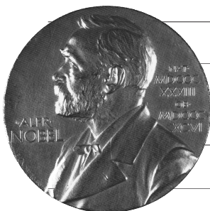
The Nobel Prize