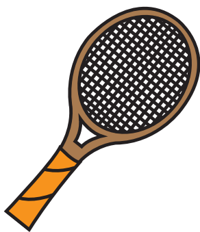
Tennis Racket $1.07

Peter and his friends are at the sport shop getting ready for some summer fun! Figure out how much change they'll have left after they pick their summer sport.