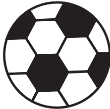
Soccer Ball 97¢