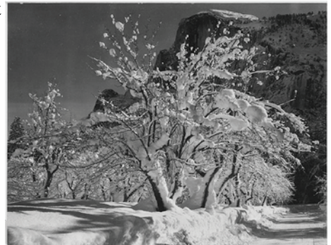
Half Dome, a famous rock formation in Yosemite. Photo by Ansel Adams, a famous nature photographer and admirer of John Muir.