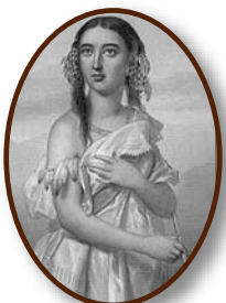
Pocahontas was the daughter of the Powhatan chief. Legend says she saved John Smith from being killed when he was captured by her tribe.