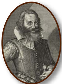
Captain John Smith became the leader of Jamestown in 1608. He returned to England in 1609 after he was hurt.