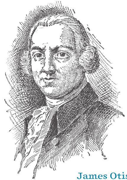
James Otis, 1725-1783

JAMES OTIS was one of the unsung heroes of the American Revolution. A Harvard graduate, he became a lawyer in Boston, where he argued against the Writs of Assistance, a law that would allow the British to enter homes and take the colonists' property for any reason. Though he worked for the government at the time, he resigned from his position and represented the people in a 1761 trial that judged the law's fairness. He did not win, but Otis soon became known as a talented public speaker, and he gave many speeches that convinced citizens to unite and take action against the British and their unjust laws. He went on to publish many political writings that helped inspire the actions that lead to the American Revolution.