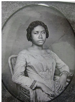
Lili’uokalani in her youth.

Think about what it means to annex an entire kingdom or nation. How would you react if someone tried to take over your home and family and put different rules in place? Why do you think the U.S. imprisoned Lili’uokalani in her own palace?