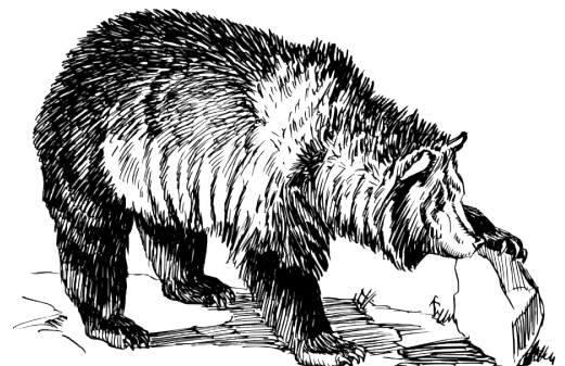
e. Grizzly Bear