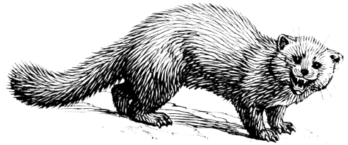
a. Pine Marten