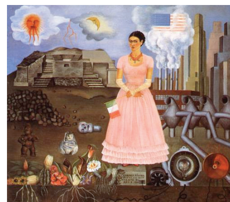
Self-Portrait on the Border Between Mexico and the United States