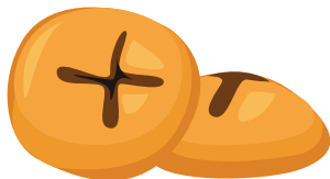
Cross on your loaf